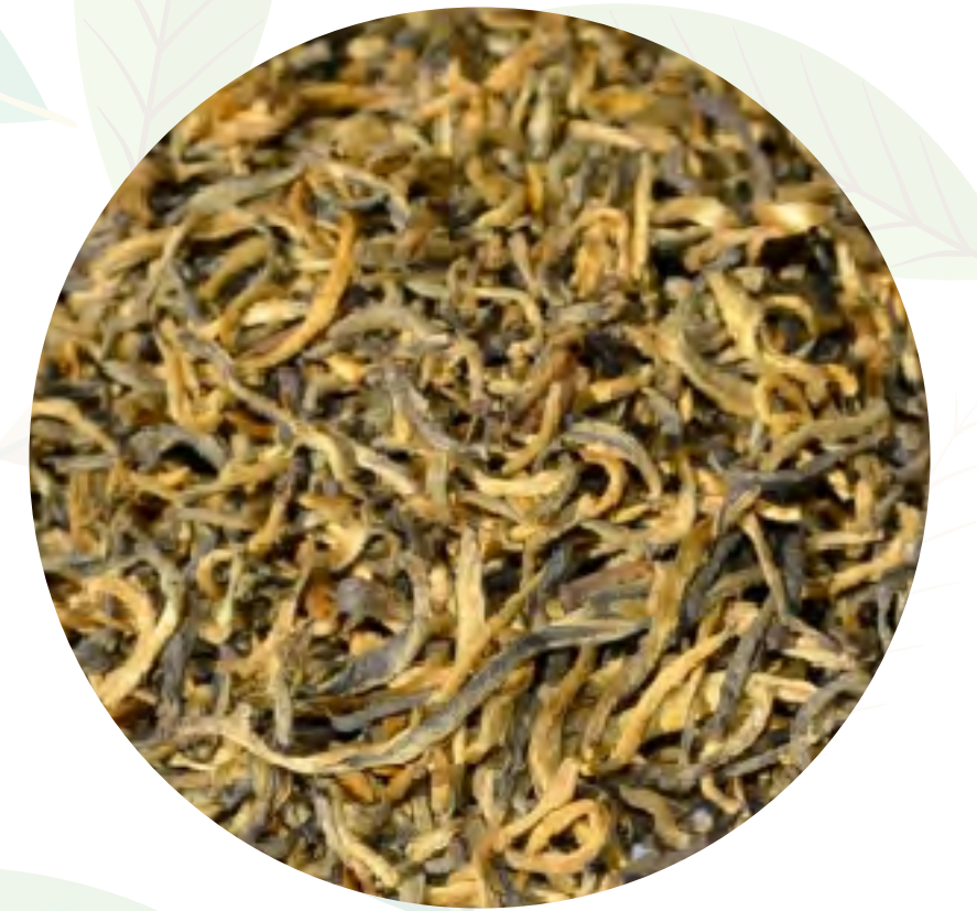
Premium Grade Oolong Tea