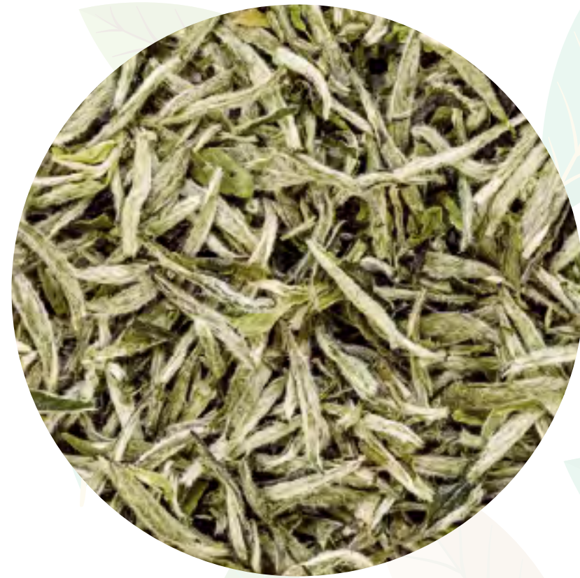
Fine White Tea