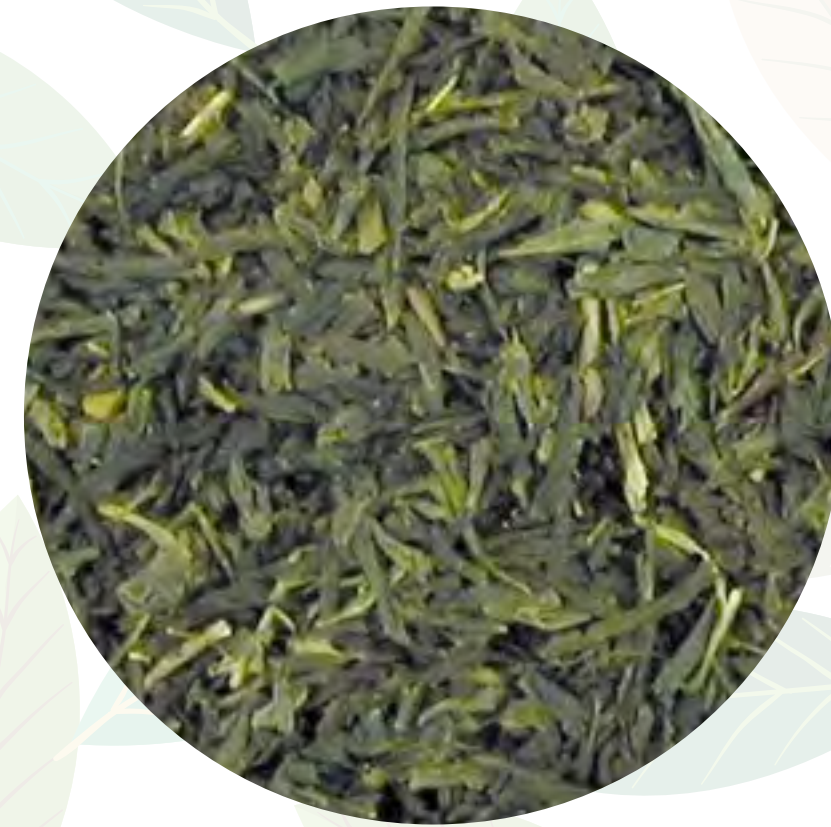
Special Green Tea